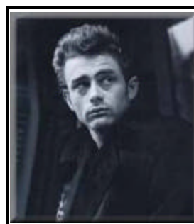
James Dean 1931-1955