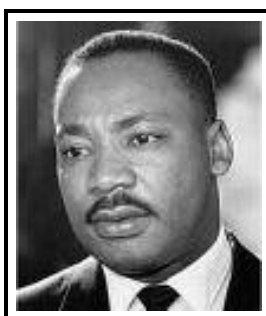
Martin L. King 1929-1968