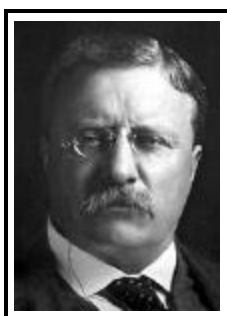
President Roosevelt 1858-1919